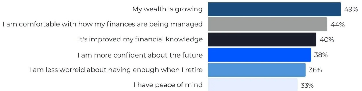
Source: Perpetual Private, (2025) 'What do you care about survey' project

As we looked closer at these benefits we also identified that they form a kind of 'virtuous circle'. Emotional benefits like confidence and comfort reinforce practical outcomes like financial progress and knowledge. And when these elements work in tandem, financial wellbeing is not just improved - it's sustained.